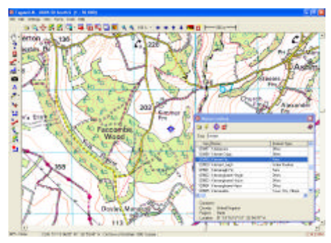
Contains a searchable Gazetteer of over 250,000 place names, historic sites, farms and more.