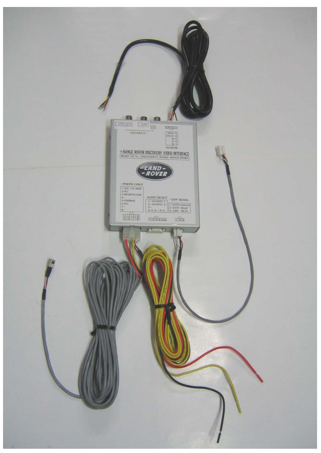
*** The picture of completion ***