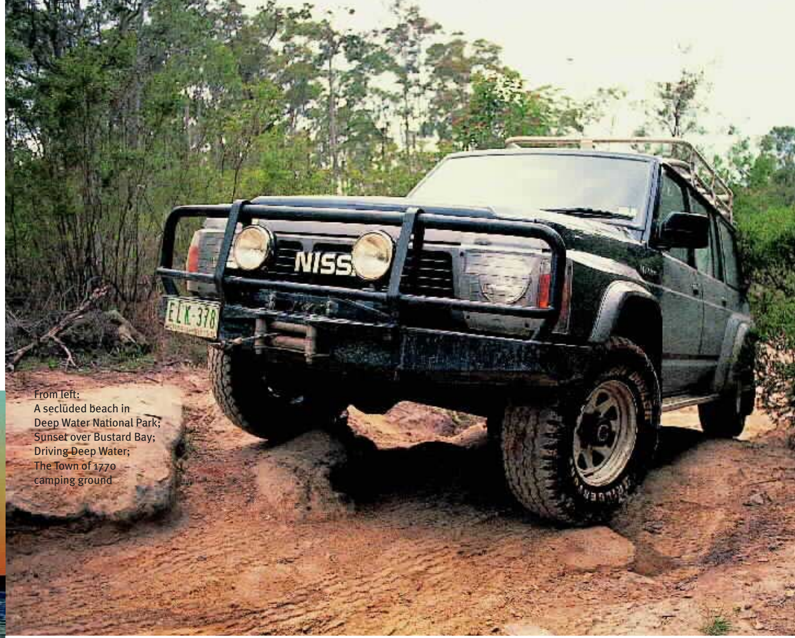
From left: A secluded beach in Deep Water National Park; Sunset over Bustard Bay; Driving Deep Water; The Town of 1770 camping ground

This stretch of the Queensland coastline, commonly dubbed The Discovery Coast, is a veritable paradise that combines magnificent, untouched beaches with aquamarine sea, rugged headlands and lush forest.