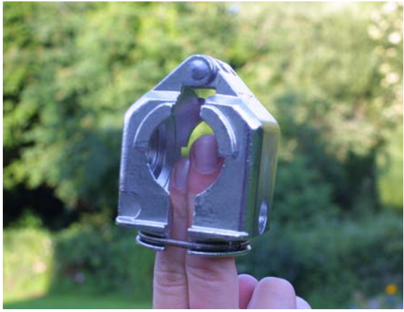
The unique bak-rak 'Clam Shell' which allows for all sorts of units to be easily installed

When the winch mount is installed, a ready made up for the vehicle wiring harness is supplied with quick disconnect fittings.