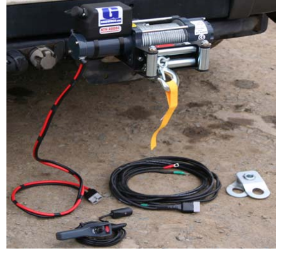
Bak-Rak mounted TDS ATV/GP4000 c/w vehicle harness & quick disconnect fittings. £299 + VAT

Even a picnic or work table can be installed in a jiffy. In fact, the list is endless, there must be a limitless number of things you can hang on a tow ball, wherever it is fitted!