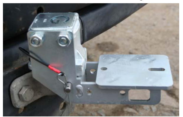
The smaller bak-rak winch unit which can be sold separately @ £39 + VAT

website under Tow Ball Mountings at www.goodwinch.com.