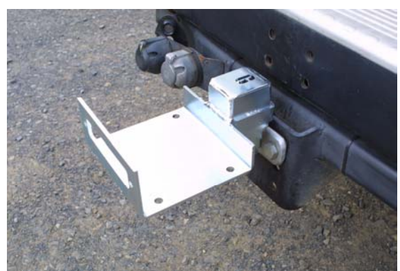
The medium sized version for 6" wide short drum winches up to 6,000lbs @ £49 + VAT