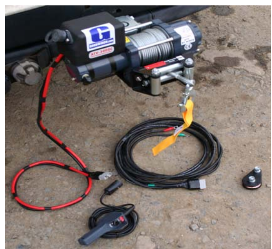
Bak-Rak mounted TDS ATV/GP3000 c/w vehicle harness & quick disconnect fittings. £279 + VAT

David Bowyer of Goodwinch joins forces with Pete Yates of bak-rak to bring to you a super range of accessories to hang onto either the rear of your vehicle, front if you can fit a tow ball on the front bumper, or the head of a trailer.