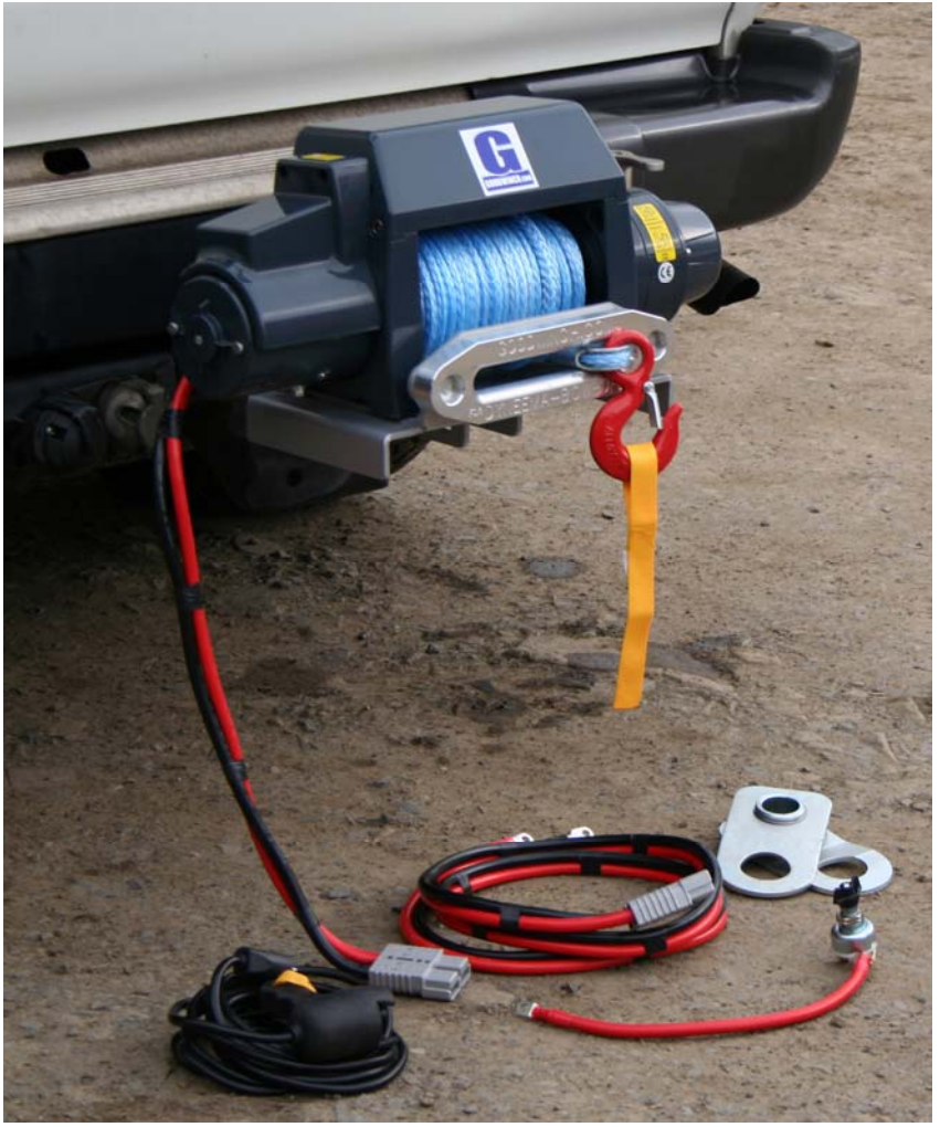
This unique sprung loaded 'Clam Shell' is "TDS-9.5i mounted on the largest of our portable Bak-Rak units with Dyneema® made of cast stainless steel which grips the Bowrope, aluminium hawse and vehicle wiring harness with quick disconnect

sphere of the tow ball. For winch mounts, fittings @ £599 + VAT the 'Clam Shell' rotates to allow the winch