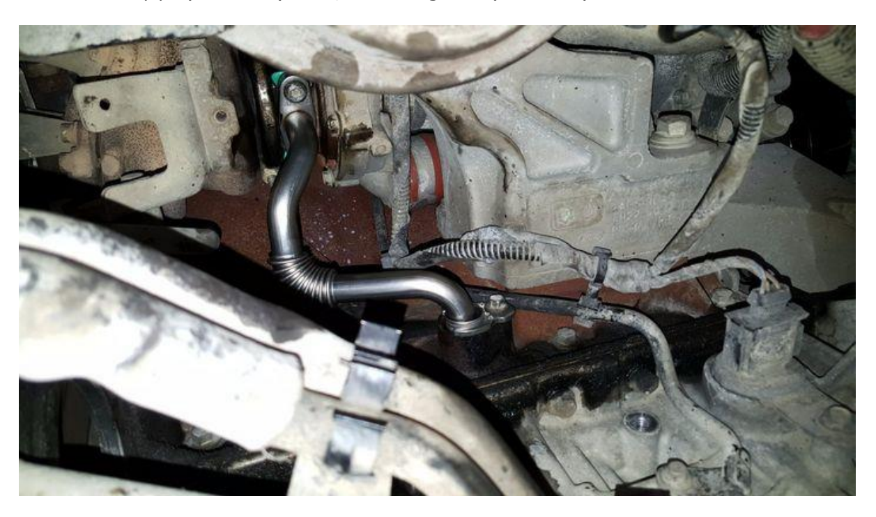
New pipe compared to the old one...