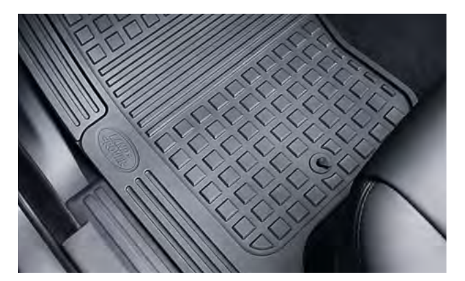
Rubber Mat Set VPLAS0252

Rubber Mats, Third Row EAH500100PMA (not shown)