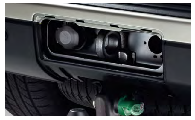
13PIN Towing Electrics VPLAT0136

for easy loading. Lockable for security. Maximum payload 36kg/79lbs**.