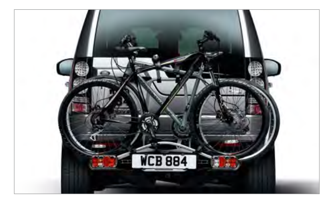
Tow Bar Mounted Two Bike Carrier VPLVR0066

The perfect choice for the cyclist, sailor or equestrian, this collection of invaluable accessories upgrades your Discovery to a serious sports vehicle adding a removable tow bar and bike carrier.