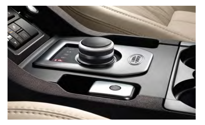
Drive Select Rotary Shifter Upgrade Silver Finish – VPLSS0142 Leather Drive Select Top Cover – VPLSS0143PVJ

This range of stylish yet practical accessories will give your Discovery a distinctive, contemporary look and add a touch of luxury to every drive.