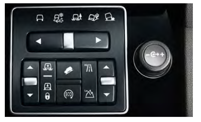
Terrain Response<sup>®</sup> System and Gradient Release Control

Visit landrover.co.uk for more information.