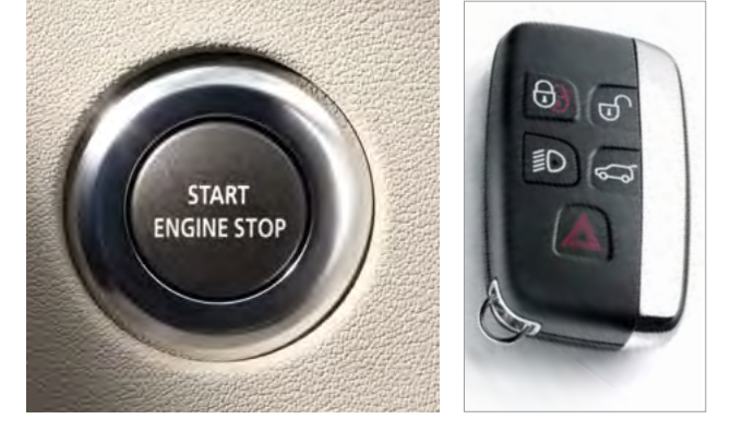
Compact Smart Key – Keyless entry/Push Button Start*

The Rear Seat Entertainment package ensures passengers can always be engaged. With two eight-inch screens built into the front headrests, a pair of WhiteFire® digital headphones and a dedicated remote control, passengers can feel truly at home with their choice of film, TV or music.