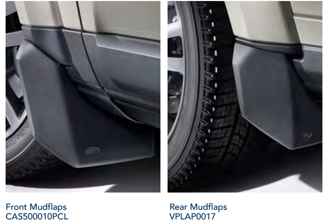
Front Mudflaps CAS500010PCL Designed to reduce spray and protect the vehicles paintwork.

Rubber Mats, Third Row EAH500100PMA (not shown)