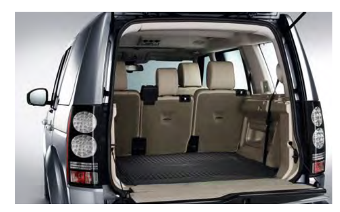
Loadspace Rubber Mat LR006401 Waterproof with retaining lip and non-slip surface.