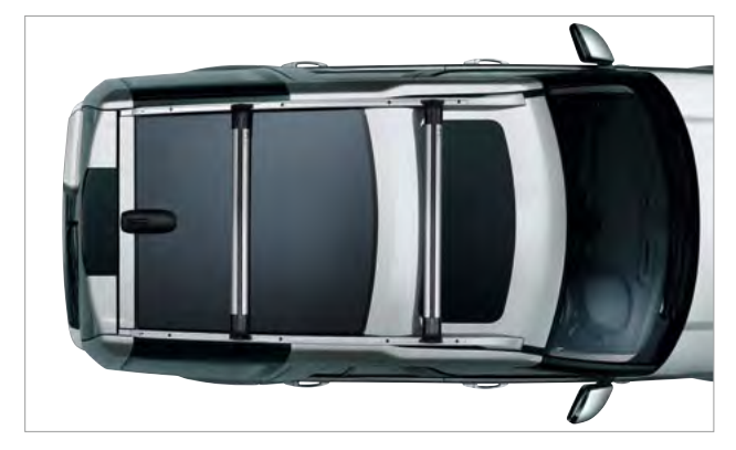
Full Length Roof Rail Kit Bright Finish* – VPLAR0075 Black Finish* – VPLAR0074 (not shown)

Please note: This accessory is not suitable for Caravans, Trailers or Lighting Boards fitted with rear mounted LED Lamp Kits.