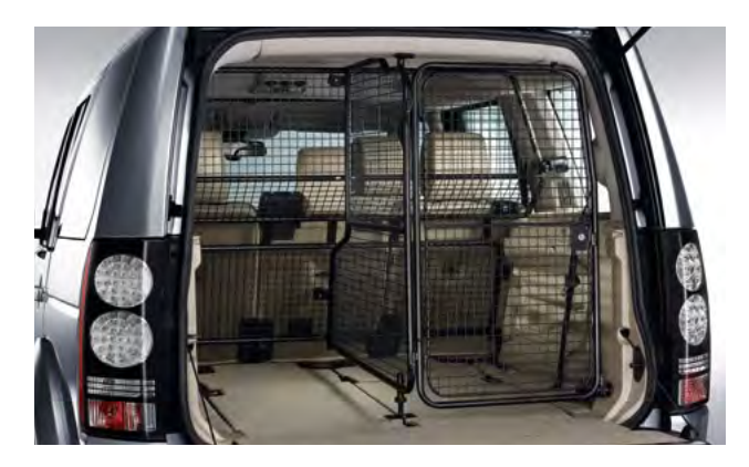
Cargo Barrier VUB501170 Easily removed. Retains cargo according to ECE-17 regulation. Can be used with standard loadspace cover.**

Keep your Discovery looking its best with this collection of accessories, designed to protect the outside from mud spray and stone chips – and the inside from muddy boots and paws.