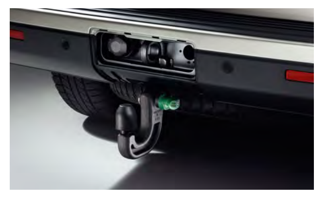
Quick Release Tow Bar<sup>†</sup> LR040247

Fits to both Quick Release and Multi-Height Tow Bars. A trailer can not be towed at the same time. For further information on Land Rover Bikes please go to www.2x2worldwide.com