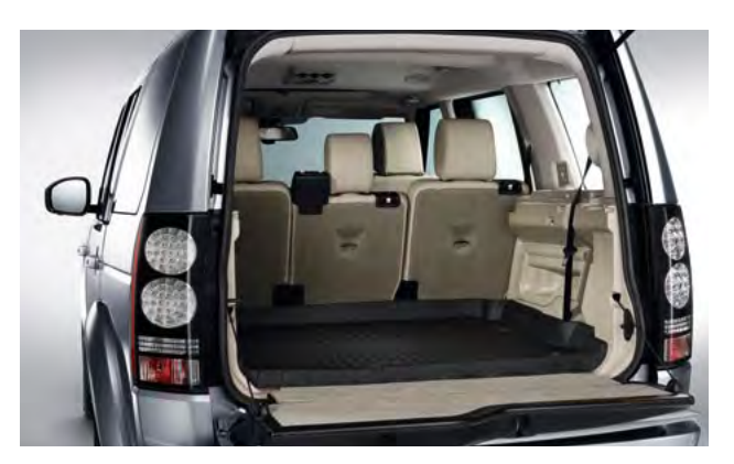
Rigid Loadspace Protector EBF500080 Compatible with Cargo Barrier and Cargo Divider.