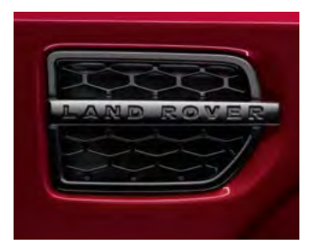
Fender vents in Narvik Black