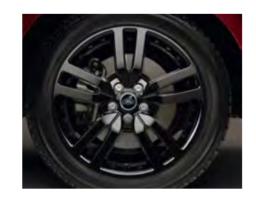
20 inch five split-spoke 'Style 510' Black alloy wheel

Visit landrover.co.uk for more information.