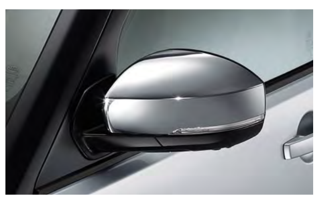
Bright Finish Mirror Caps VPLAB0132 – Upper

Personalise your Land Rover and also enhance the vehicle styling as well as adding protection to the sills.