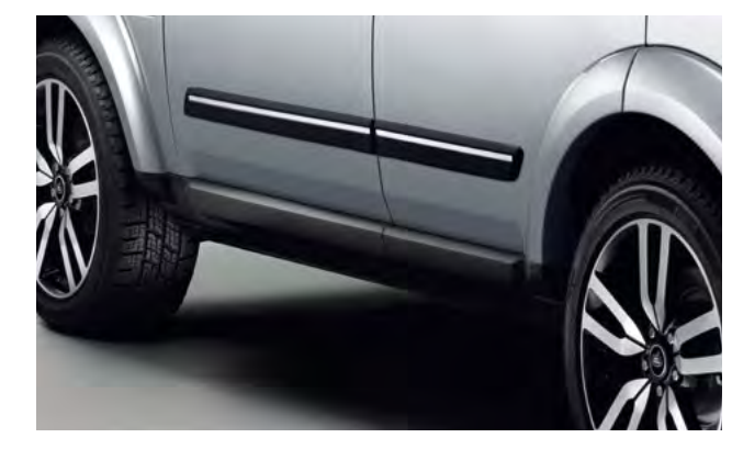
Body Side Mouldings with Black Bright Insert VPLAP0013

Stainless Steel Rear Bumper Tread Plate LR006874 An enhancement to the rear sill bumper treadplate. Styled stainless steel rear bumper protection.