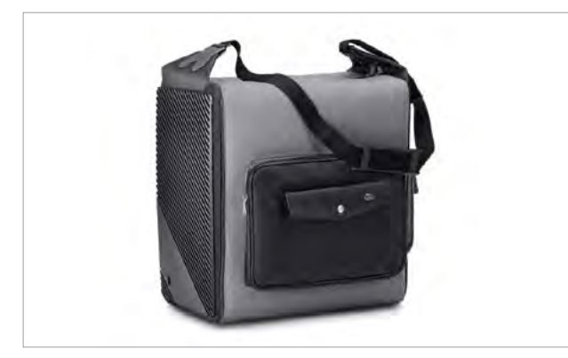
Electric Cool Bag VUPI00140L

Gloss Black Finish. Opens from both sides. Lockable for security. External dimensions: 1,750mm long, 820mm wide, 450mm high. Internal volume 440 litres. Maximum payload 75kg<sup>†</sup>.