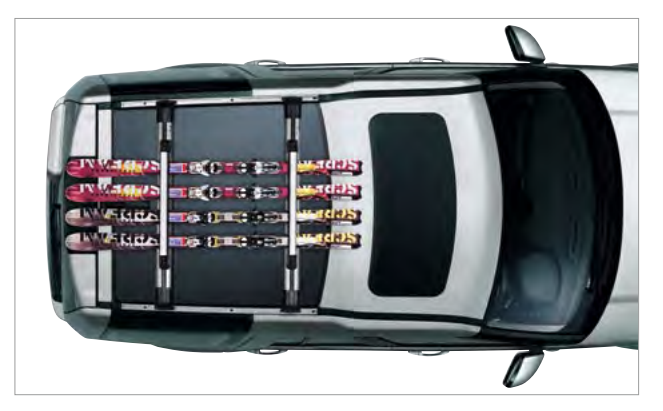
Ski/Snowboard Holder* LR006849 Carries four pairs of skis or two snowboards. Incorporates slider rails

Hidden loadspace stowage block. Seven-seat vehicles only.