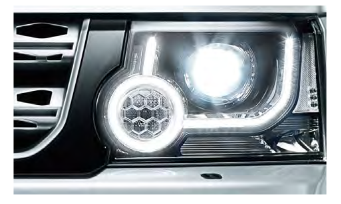
Automatic headlamps with High Beam Assist and xenon adaptive headlamps with LED signature \!\!\!^\star

Detects vehicle headlamps/tail lights and dips the high beam until the light source is out of range. The system is able to distinguish between automotive and non-automotive light sources.