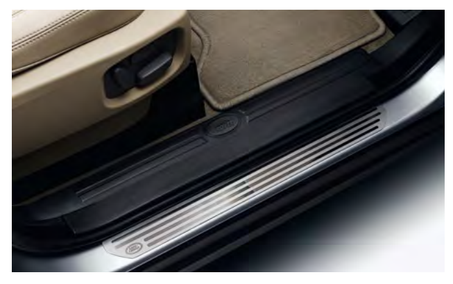
Stainless Steel Treadplate EBN500041 Covers front and rear door sills.

Enhance the appearance of your vehicle's interior with this stylish Rotary Shifter and Leather Drive Select Top Cover.